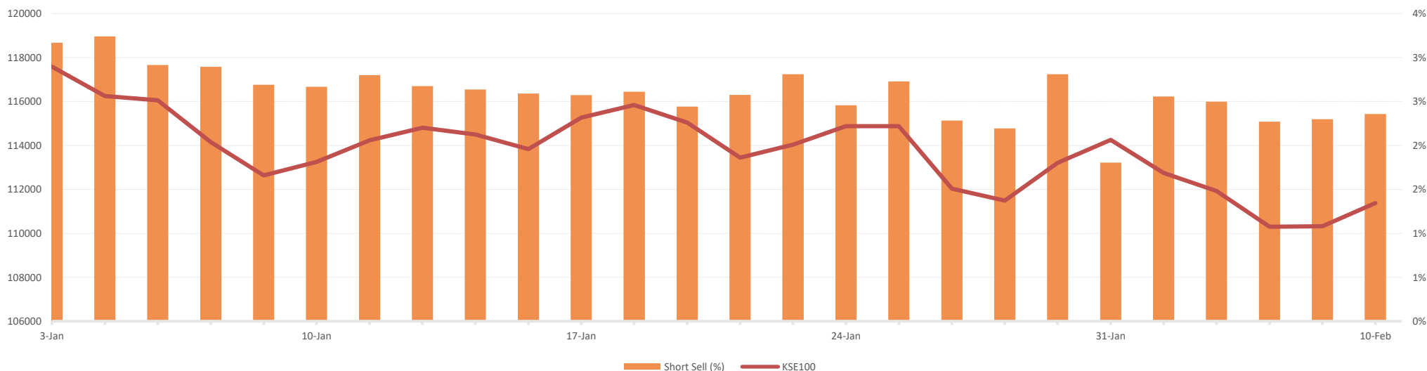
KSE-100 VS % Short Sell Of Total Open Interest